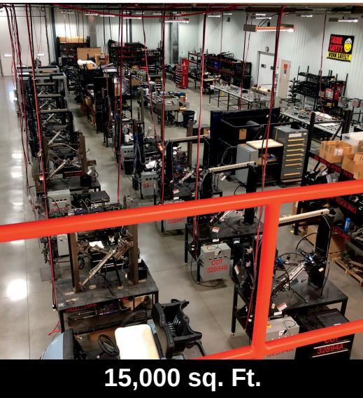
15,000 sq. Ft.